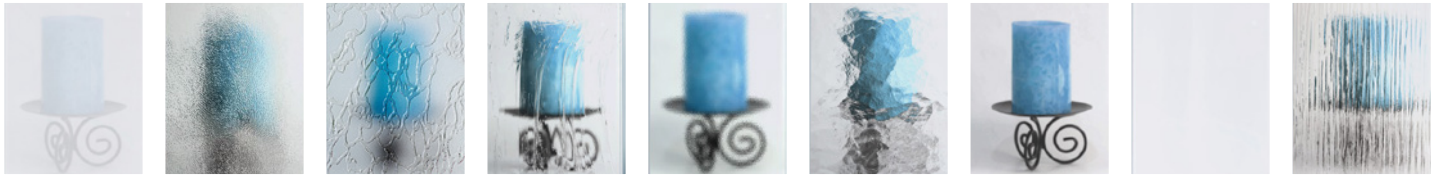
Satin Etch (Satinato)

Building on the proven performance of Low E3, our Advanced Performance Glass adds an additional layer of protection, creating our highest-efficiency option for demanding climates and strict energy codes.